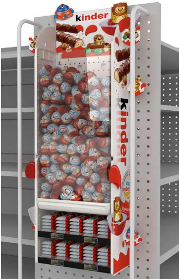
Double Gravity-Feed SideKick Max with branded cladding

*plastic pegs optional extra subject to minimum quantities. contact Kyta for more information