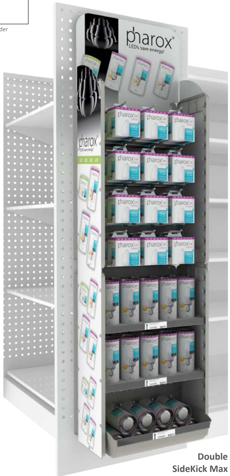
Double SideKick Max with branded cladding, peg board, shelf merchandiser & bulk tray